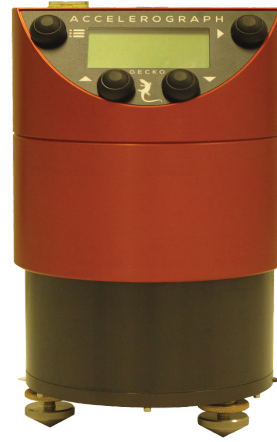
Gecko SMA-HR Strong Motion Accelerograph