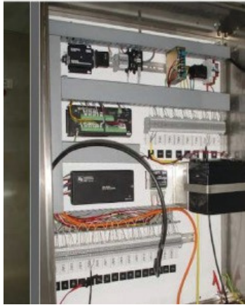
Automatic Pore Pressure Recording System AL-131-VWP