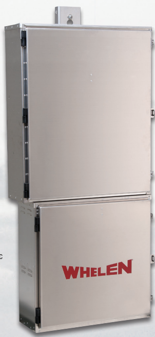
Type III Electronic Cabinet