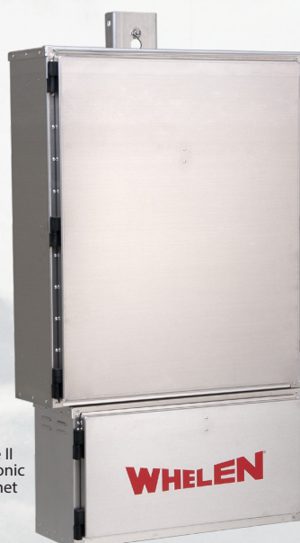
Type II Electronic Cabinet